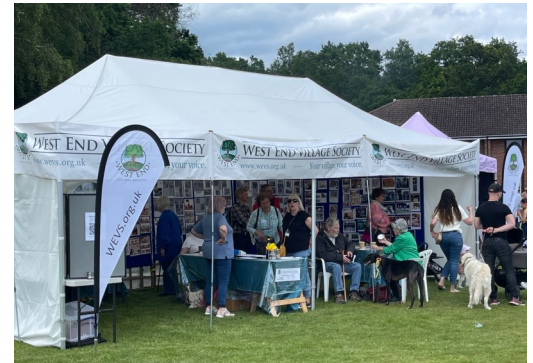
WEVS Marquee - Fete 2024

The stand will also provide information displays, and will be selling copies of our history book and maps of local walks. Subscriptions to WEVS may be paid (see page 9 for details). For more about the fete see the back page of this newsletter.