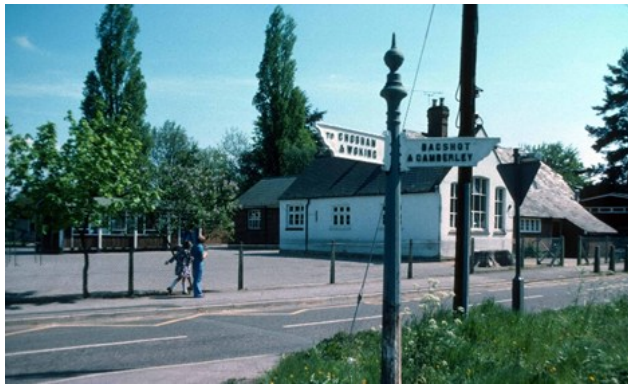
The Old Infants School - Circa 1975