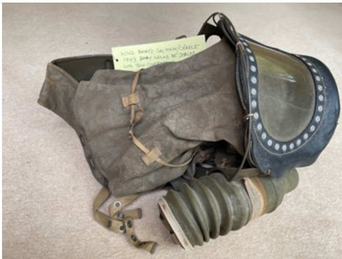
Baby's Gas Mask

There were also other physical items dating back to the war. For example there was a mess room hooter from a local airfield which was used to scramble RAF pilots to their planes when air raids were approaching. There were an air raid warden's helmet and the wooden rattle used to sound the All Clear after a German air raid.