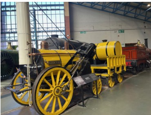
Rocket - replica