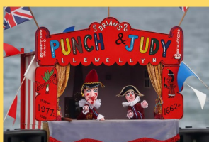
Punch & Judy