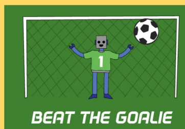
BEAT THE GOALIE