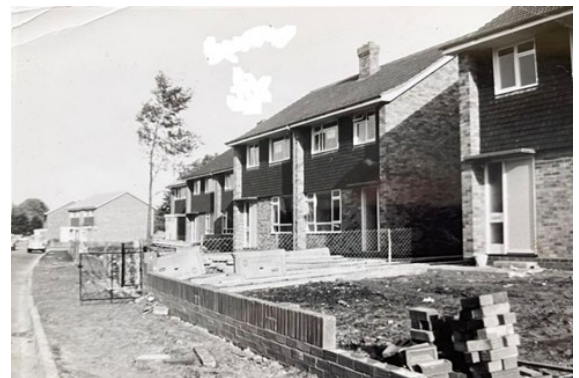
Malthouse Lane Under Construction - 1965