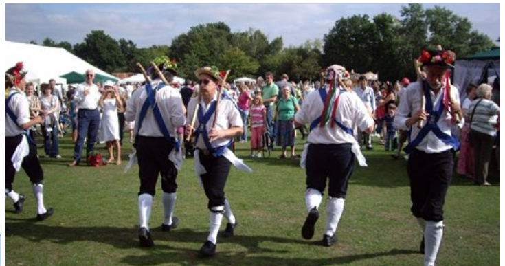
2007 Ag & Hort Show - Morris Dancers

To receive regular updates on WEVS events visit facebook.com/WestEndVillageSociety or www.wevs.org.uk