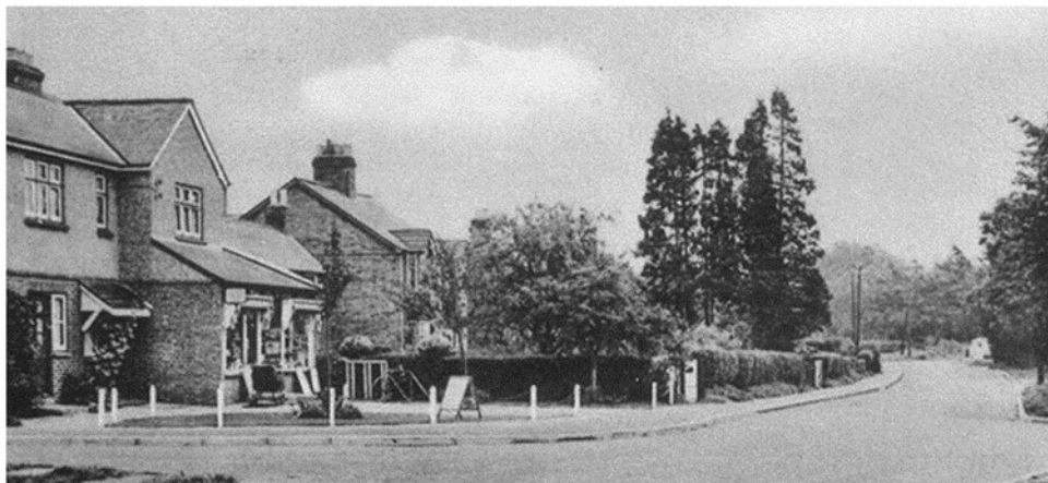
The High Street West End c1950