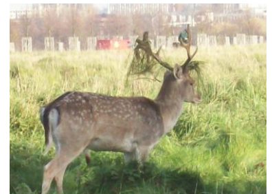
At home in the park

We wish you all a happy Christmas and New Year and hope you enjoy the walks in 2011.