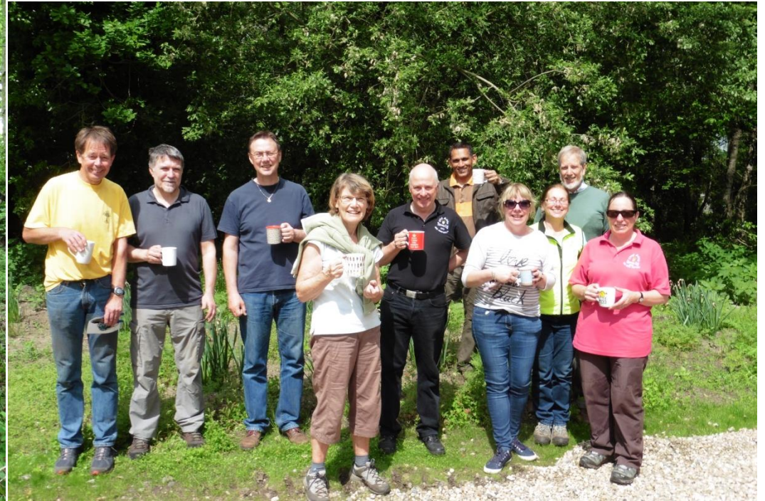
It wasn't all hard work